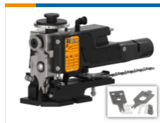
TE Part # 7-4150059-2 OCEAN-2.0-APPLICATOR-E-140F