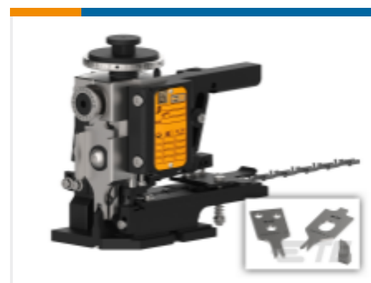
TE Part # 7-4150059-1 OCEAN-2.0-APPLICATOR-E-140F