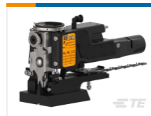
TE Part # 2-4150059-2 OCEAN-2.0-APPLICATOR-E-140F