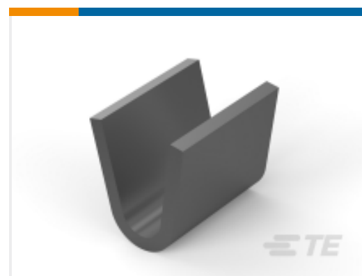
TE Part # 160660-2 SPLICE 22-18 AWG .013 TPBR