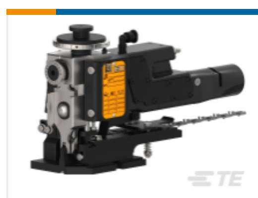
TE Part # 4150059-2 OCEAN-2.0-APPLICATOR-E-140F