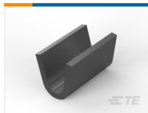
TE Part # 140723-2 SPLICE 22-16 AWG .02 TPBR