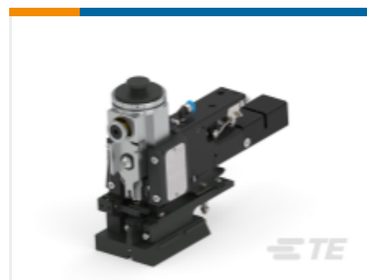
TE Part # 4150059-1 OCEAN-2.0-APPLICATOR-E-140F