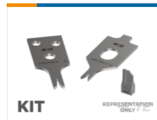
TE Part # 7-4150059-7 OCEAN_2.0_SPARE_PART_KIT-140F