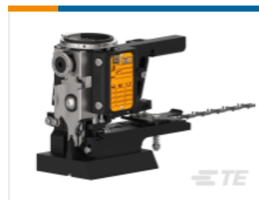
TE Part # 2-4150059-1 OCEAN-2.0-APPLICATOR-E-140F